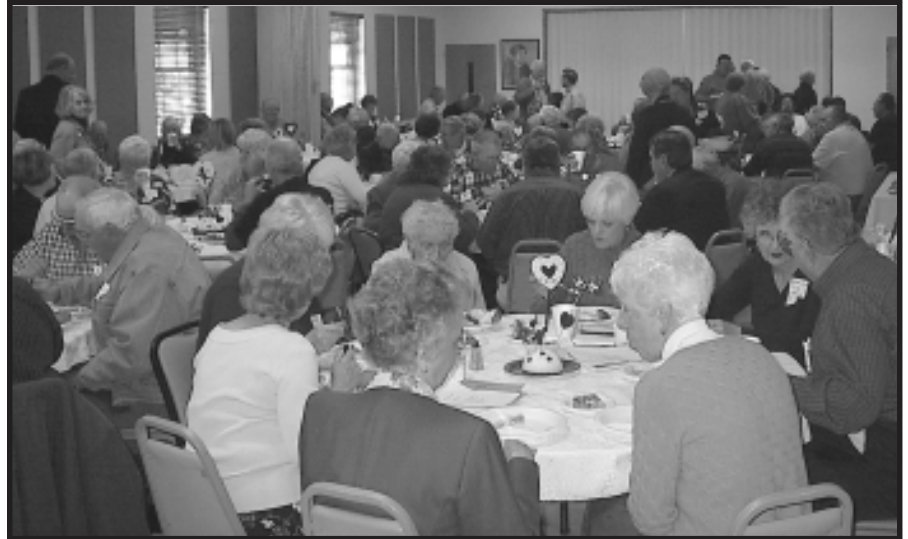
Fellowship time at Texas LCMC gathering