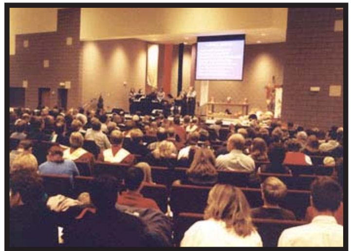
One of three Atonement's three praise bands, leading contemporary worship in "The ARK" - the church's multi-purpose gymnasium.

We like to think that we begin each week accepting this challenge in all four of our Sunday worship services; two quite traditional, two very contemporary. We also believe that growth in faith and discipleship begins by actively involving everyone in God's Word. That is why you may not get a hymnal at the door, but you will be handed a Bible. On Wednesday evening we share in family worship called "The Potter's Wheel." In Potter's Wheel we have praise time, creative teaching for everyone,